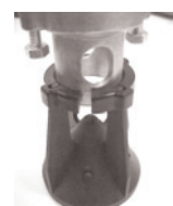
Snap cone assembly into position over the nozzle outlet