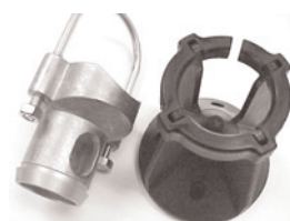
Note the profile at the end of the nozzle