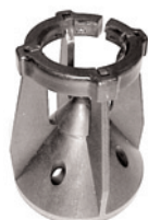
Snap the clip into position over the four legs