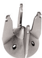
Note the profile of the four legs of the cone

When installing into baghouse, the end of the cone should lie between 30 and 80mm (1.13" and 3.14") from the filter opening.